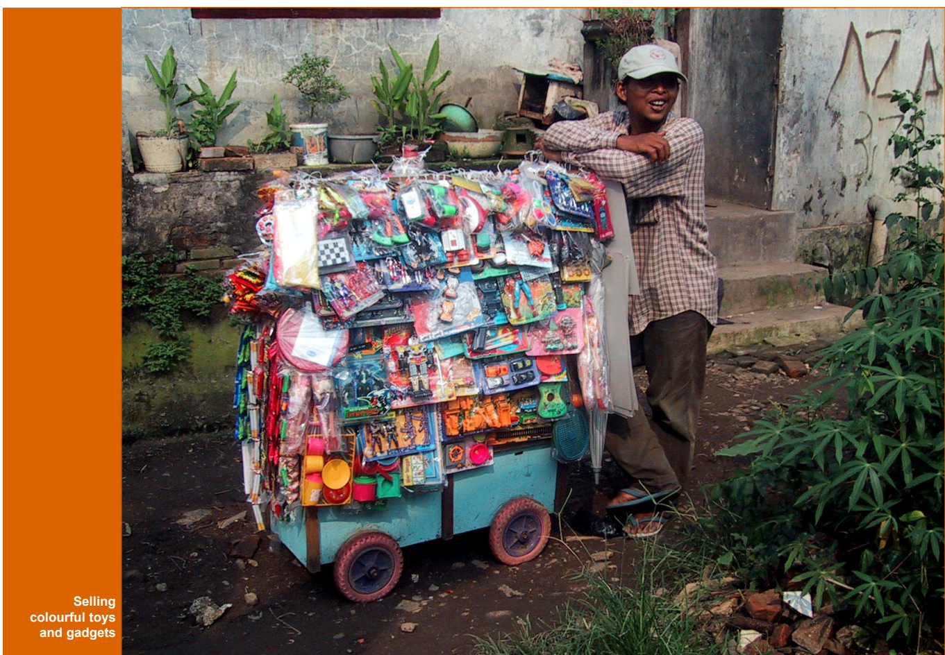
Selling colourful toys and gadgets

With most teachers receiving poverty-level salaries - a primary teacher in Jakarta with five years of experience officially takes home a salary in the range of Rp. 500,000 per month (about US$50) - it is not surprising that Indonesia faces a shortage of more than half a million teachers. 54 Petty corruption is rampant in the education system - a means of making ends meet for the thousands of underpaid teachers. Delay in the transfer of state subsidies (which includes teacher salaries) is commonplace and, in many instances, the full amount is never received. This leaves the schools themselves responsible for making up their budget shortfall. They do so by charging so-called "building fees" to newly registering students (typically in the range of US$30 to $100 on a one-off basis) and with a host of other off-budget charges that must be borne by parents - main-