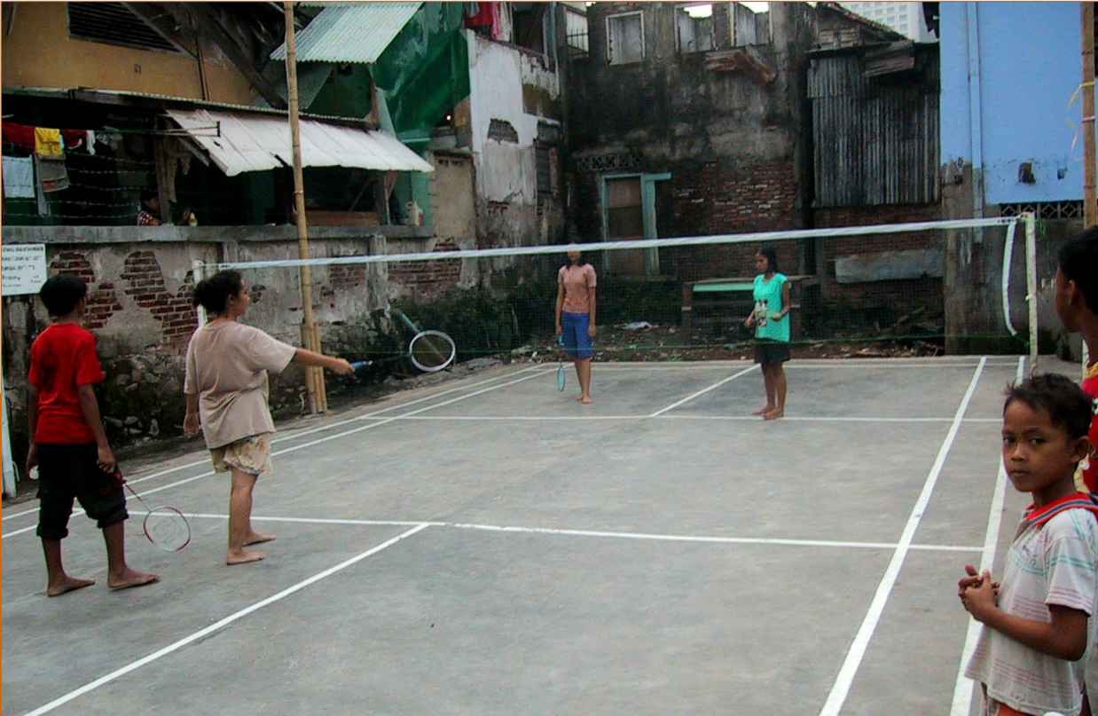
Playing badminton amongst friend