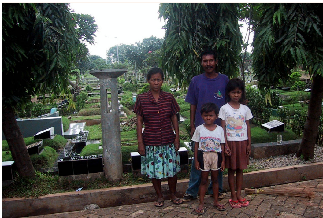
Residents from one of the settlements

People overwhelmingly prefer to go to local hospitals for anything other than routine medical treatment, in part because doctor services are rarely available at the Puskesmas. Hospitals, however, are divided into three classes with publicly-funded Class III institutions avoided by all but the most destitute. Class I and private hospitals are much preferred, but it costs a minimum of Rp. 17,000 (US$1.70) just to obtain an appointment to see a qualified doctor, with additional outlays for treatment and medicine once a diagnosis is made. For anyone requiring actual hospitalisation, the cost is seen as exorbitant – usually upwards of Rp. 60,000 (US$6) per night, excluding food. A tiny amount by Western standards, but prohibitive for most residents of Karet Tensin.