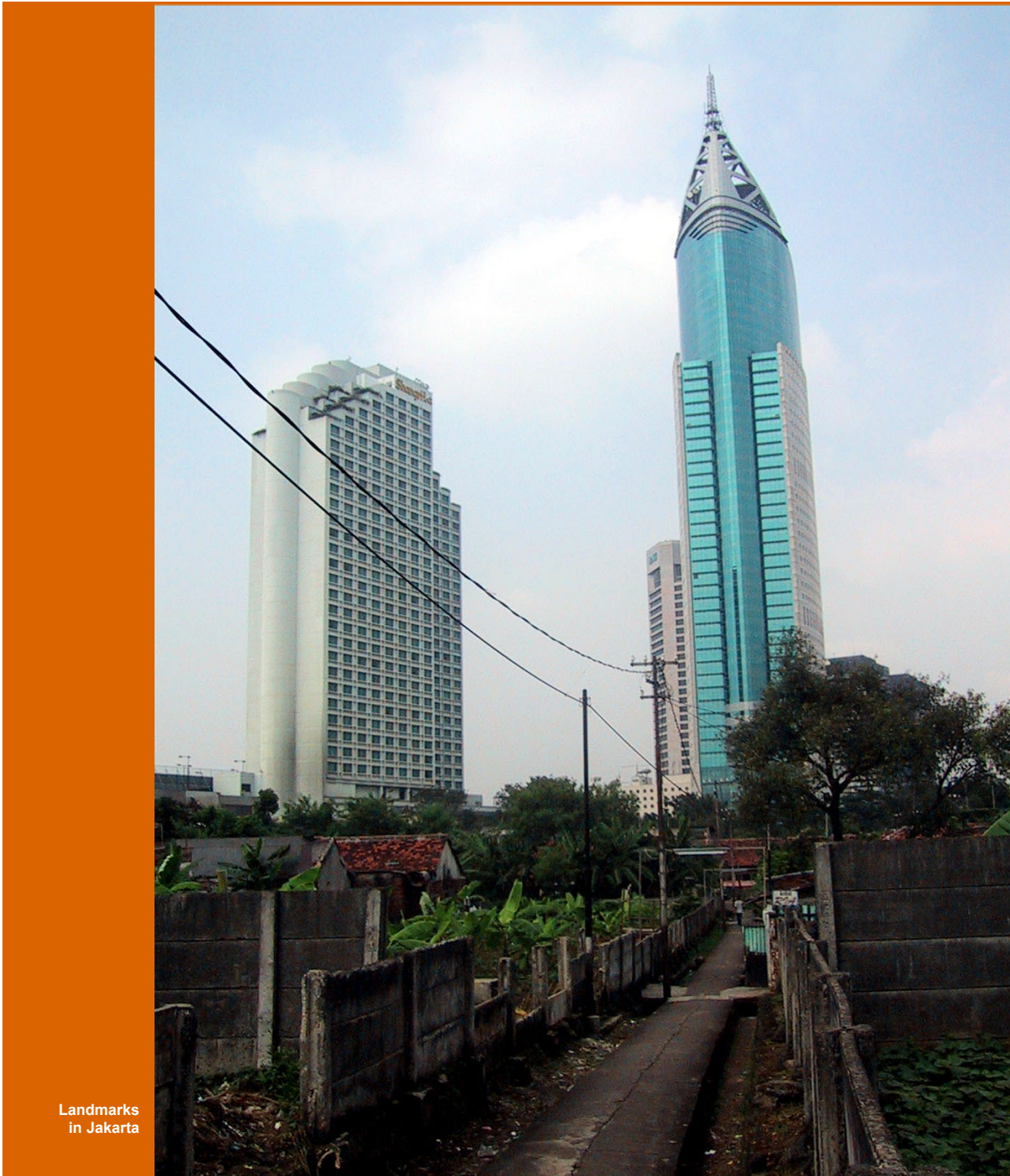
Landmarks in Jakarta

of its founding as a port, Jakarta served as the capital of the Dutch East Indies for over three centuries. Despite its status as the national capital – which it retained after independence was declared in 1945 - Jakarta has, until recently, been perceived – even by many Indonesians - as little more than a tropical backwater. Unlike the rival cities of Bandung and Yogyakarta, it was not a well-known cultural, intellectual or academic centre, nor was it close to the agricultural or manufacturing heartland of the country. But in one the world’s most politically