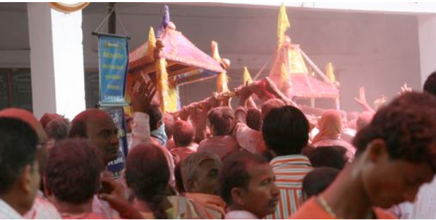
Funeral March/Pālakhīyātra/Antimayātra (Shankheshvar, 13 NOV 09)