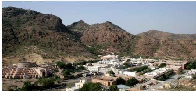
Nakoda Parshvanath Jain Derasar