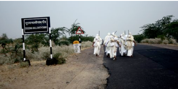
Balotra-Barmer Road (11 NOV 09)