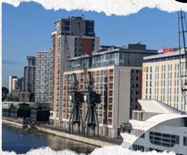
IMAGE 6: HOTELS LINING THE ROYAL VICTORIA DOCKS