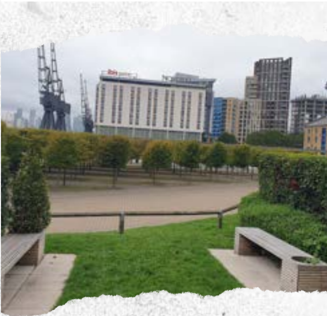
IMAGE 7: WELL- MAINTAINED GREEN SPACE NEAR EXCEL LONDON