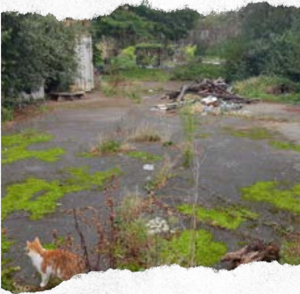
IMAGE 8: ABANDONED ALLOTMENT IN CUSTOM HOUSE (PICTURE TAKEN IN 2021. THE SITE HAS SINCE BEEN BOARDED UP)

jobs for the community. Most events at ExCeL, for instance, outsourced their staffing needs to agencies. Training opportunities to work in the hospitality and events sector were also not made available to residents, making it difficult for them to access what opportunities they could find.