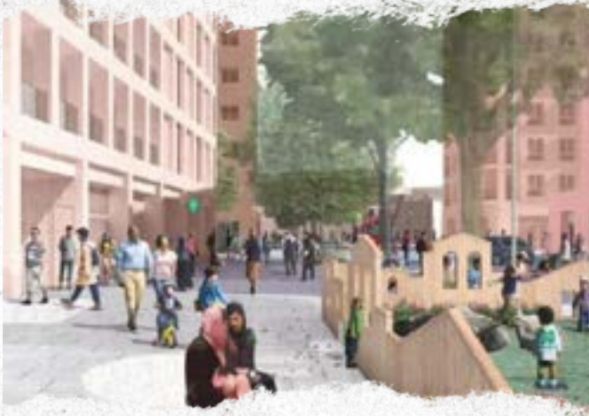
IMAGE 1: MOCK-UP OF THE CUSTOM HOUSE REGENERATION PLANS PROMISED IN THE EARLY 2000s