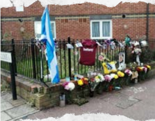
IMAGE 9: A MEMORIAL TO A YOUNG MAN WHO WAS KILLED IN CUSTOM HOUSE.