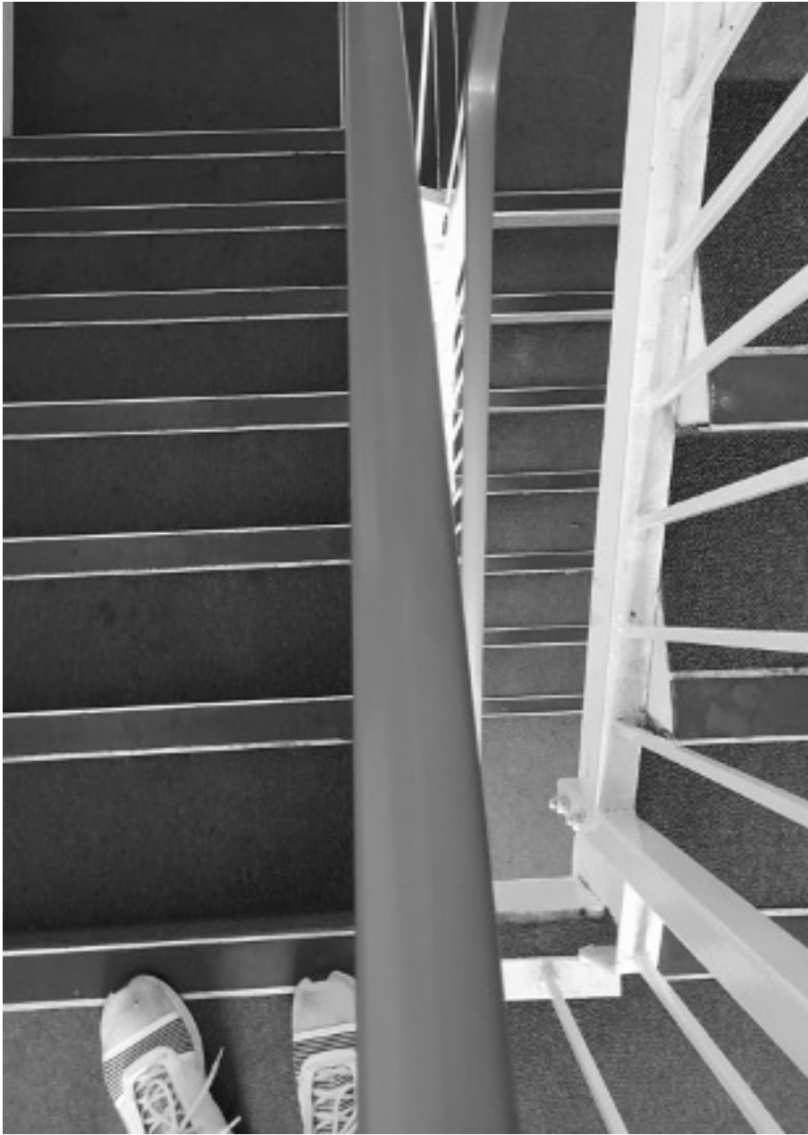
Figure 1. Victorin's journey down the stairs from her 1 st floor apartment