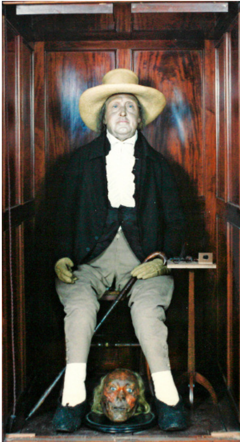
Figure 4. The Auto-Icon. A wooden cabinet stands at the end of the South Cloisters of the main building of UCL and has been a source of curiosity and perplexity to visitors.

Friday (Figure 4). By having his body preserved in this way, Bentham hoped, amongst other things, to attack religion by ridiculing belief in corporeal resurrection. He also hoped that people interested in the principle of utility and its founder would, by meeting by the Auto-Icon, remember him and his work. Visitors from all over the world can be seen on a daily basis peering into his box, and looking at the nearby displays on his life, works, and the work of the Bentham Project.