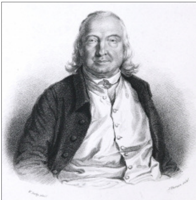
Figure 1. Engraving of Jeremy Bentham, 1823, by James Thomson (1788–1850) after William Derby (1786–1847).

Other forthcoming volumes include a work on the reform of the Church of England, which shows the correlation between Bentham’s views on organised religion and his political views, and for the publication of which in 1818 he risked prosecution for blasphemy; and a volume of writings on Spanish affairs in the turbulent period of the ‘liberal triennium’ of 1820–23, containing Bentham’s critique of a draft penal code, his comments on current legislation curtailing freedom of the press and public political meetings in Spain (see extract), and expressing his opposition to the introduction of an upper house in the Spanish parliament.