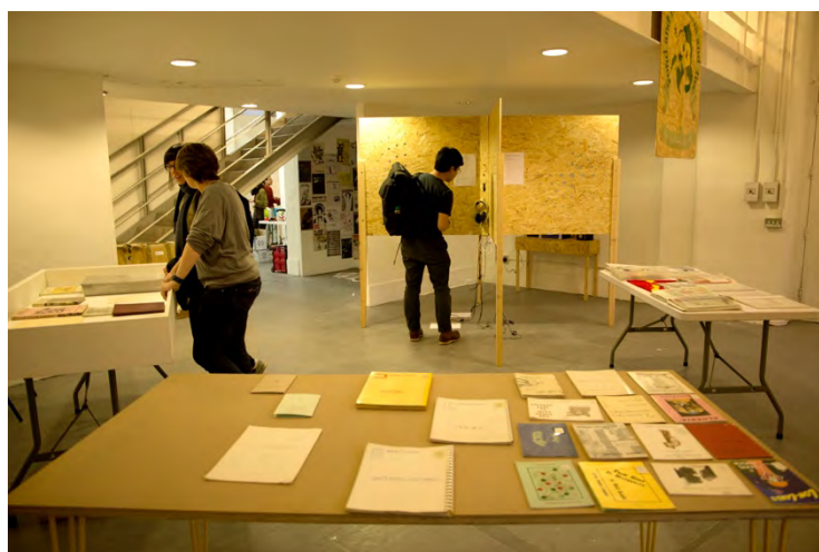
Installation shot of the Small Press Project Exhibition 2019

Talks took place from 1.30pm on Friday 8 th March. Live performances from Slade students and alumni took place on Saturday 9 th from 5pm and Sunday 10 th (schedules and biographies attached).