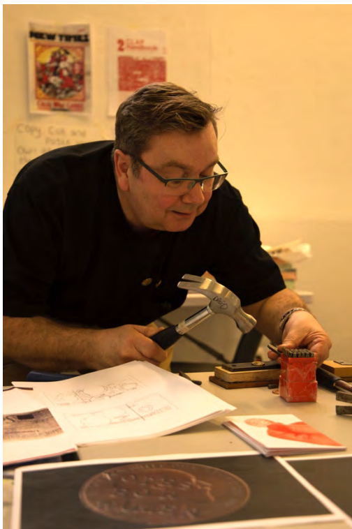
Currency Defacing Workshop