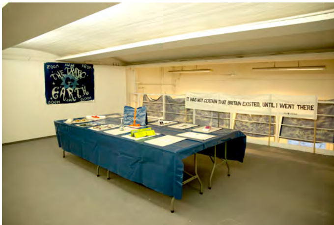
Installation shot of SWAP Editions BREX:KIT presenting at the Small Press Project Symposium 2019

SWAP is an artist run, not-for-profit initiative that operates with zero public funding and was created by London based artist Robin Tarbet. As a DIY project it is sustained by swapping art objects with time and services, and deliberately puts all emphasis of value within the collective artworks rather than their potential monetary value. SWAP Editions and associated artworks are not for sale - but a limited number are available to swap.