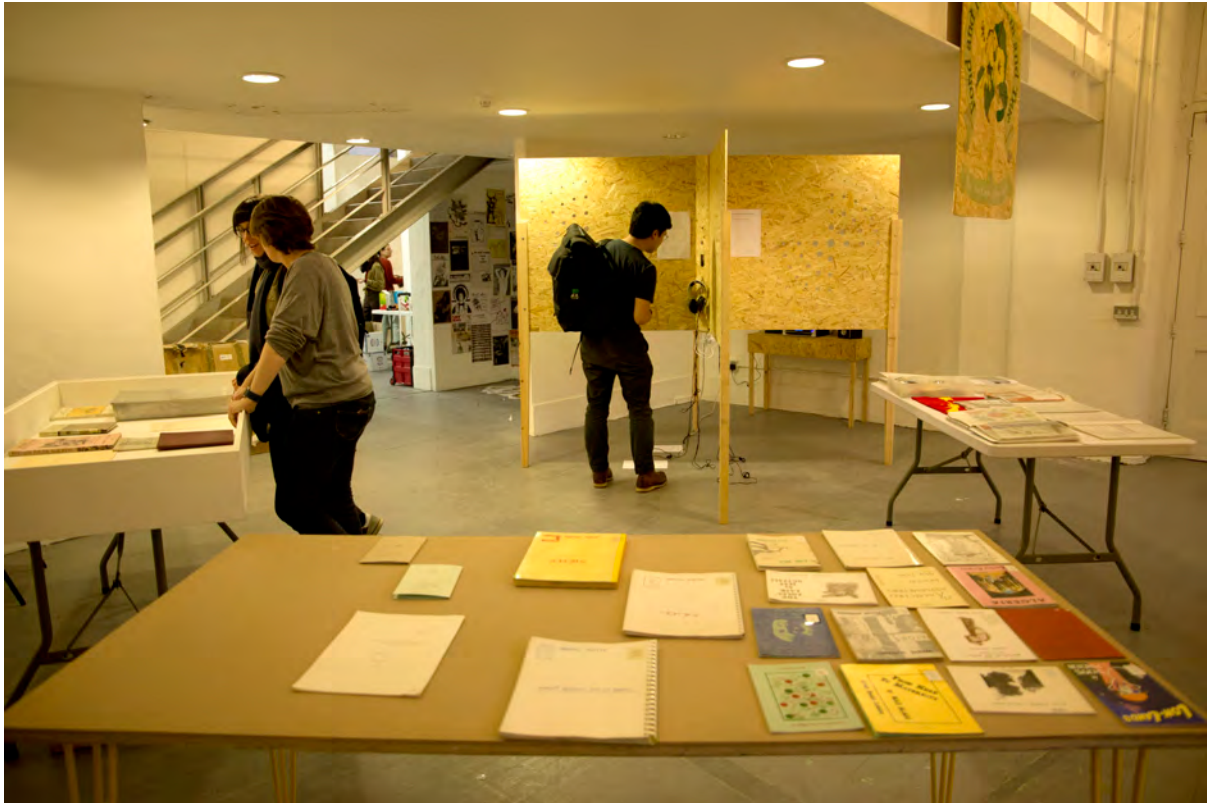
Installation shot of the Special Collections display with listening booths

Purpose built listening booths allowed audiences to hear sound works by Slade staff and students and audio material from the Special Collection, and a collection of protest songs from Kieren Reid's archive.