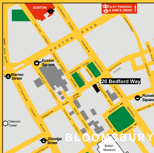
© Drawing Office, UCL Department of Geography