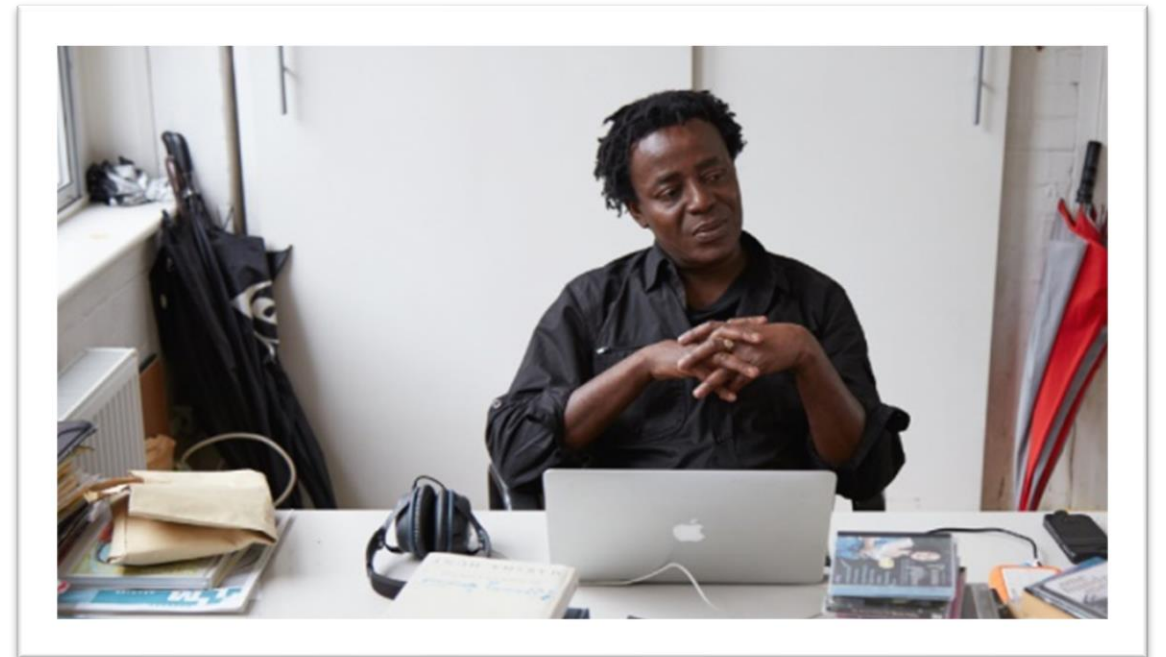
John Akomfrah at his London studio, 2016.

More information at https://venicebiennale.britishcouncil.org/john-akomfrah-ra