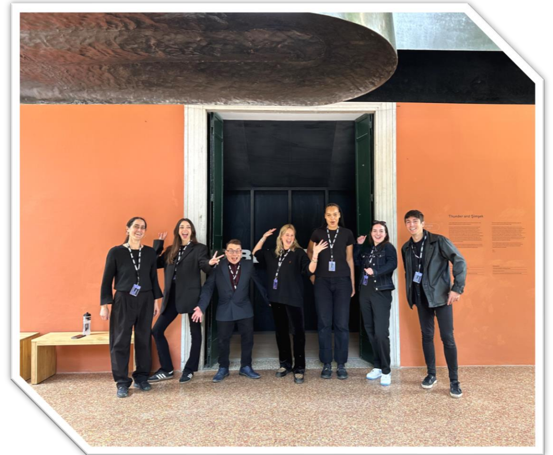
Fellows Group 1, May 2023

Fellows are required to attend an Online Induction School Training from February to April 2024 so they can prepare for their Venice trip and participate in a series of talks and workshops to network and build together a community of practice throughout the 2024 year.